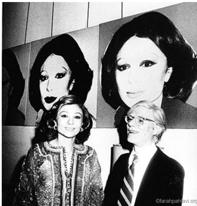
Farah Pahlavi, former empress of Iran, with Andy Warhol, c1976

Considering the decades of economic chaos in Iran and the near-mythical reputation of the collection in the west, it's something of a miracle that it has remained more or less intact since being spirited into an air-conditioned vault during the mayhem of the 1979 revolution. Some claim it was due to the newly formed Islamic Republic being persuaded