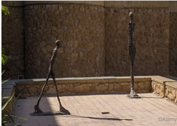
Giacometti sculptures at the Tehran Museum of Contemporary Art