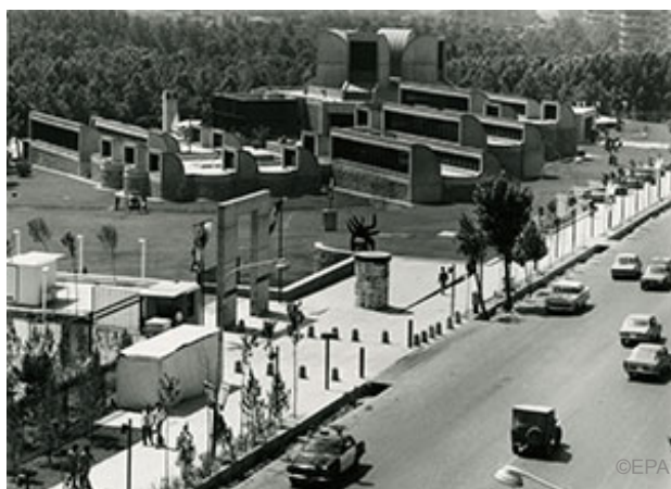
The museum in 1978

At the opening of TMOCA in 1977 Diba made an impassioned speech which included the line, “This Museum must be like a bulldozer . . . to clear the way for more open and adventurous artistic values.” Sadly, barely two years later, Diba was in exile in Paris and the museum’s collection placed in storage.